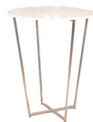
Gloss Display Table